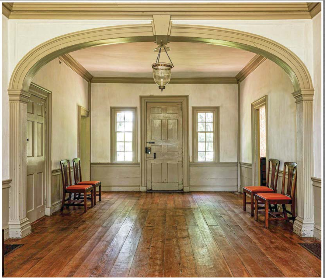
The first floor main hall looking south. A welcoming space which could be used for a variety of purposes.