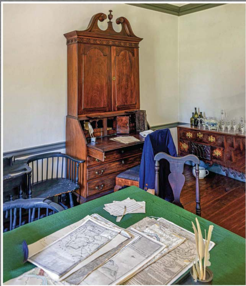
Detail of the front parlor exhibited as Washington's conference room. The secretary desk is an original Ford family piece.