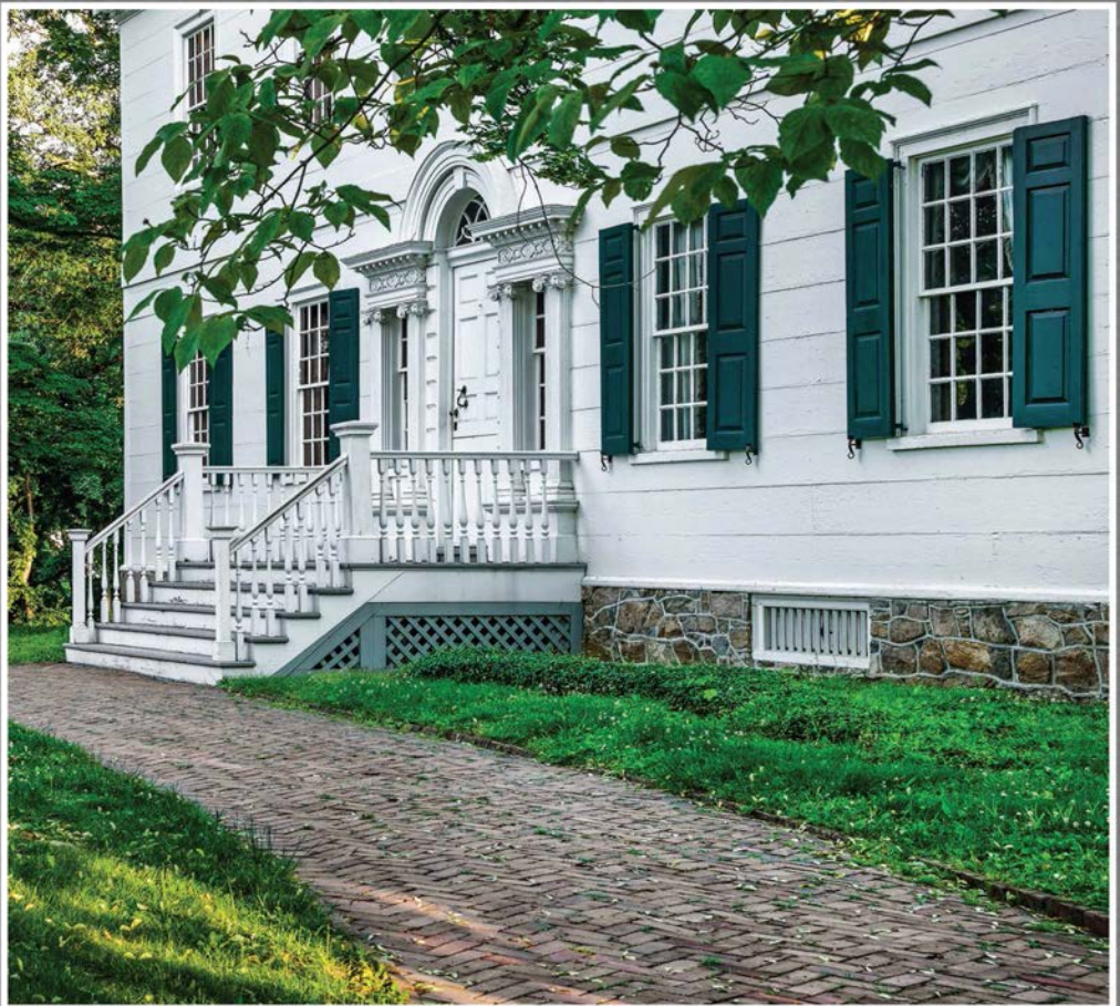
Approaching the distinctive front door of the 1770s Georgian-style Ford mansion from the southeast.