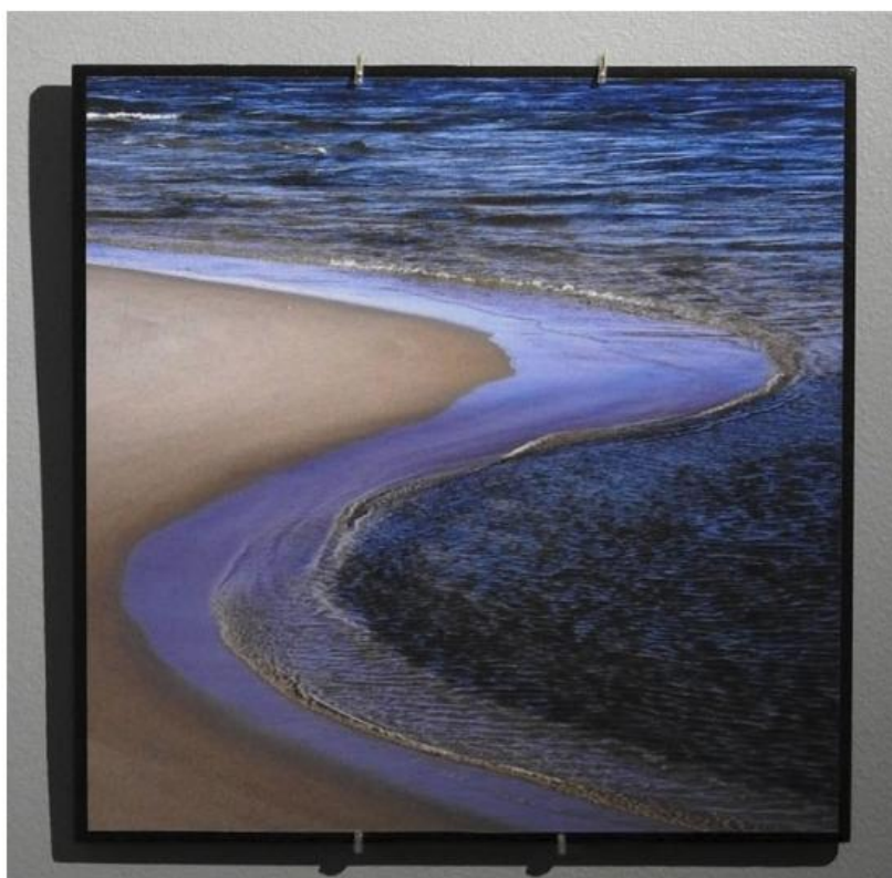
"Fire Island National Seashore, High Dunes Wilderness" - Photo Ceramic by Xiomáro.

The Visitor Center is open Wednesdays through Sundays from 10:00am to 4:00pm until October 29, 2017.