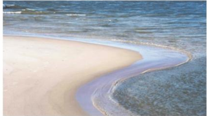
Xiomaro's photograph of Fire Island's Dunes Wilderness is on display at the Patchogue Ferry Terminal to celebrate 100 years of the National Parks Service.

lose it eventually because we can't take care of it?" he said.