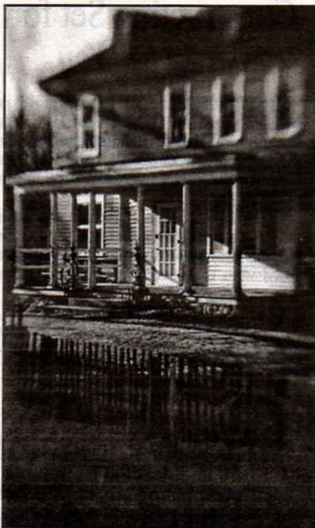
The Spirit of J. Alden Weir

"The ability to create that transformation was intriguing and moved me behind the camera," he added. "A body of artistic work soon followed that included portraits, landscapes, digital collages, bodyscapes and abstracts. Many of these photos were regularly exhibited and sold at my coffeehouse concerts throughout