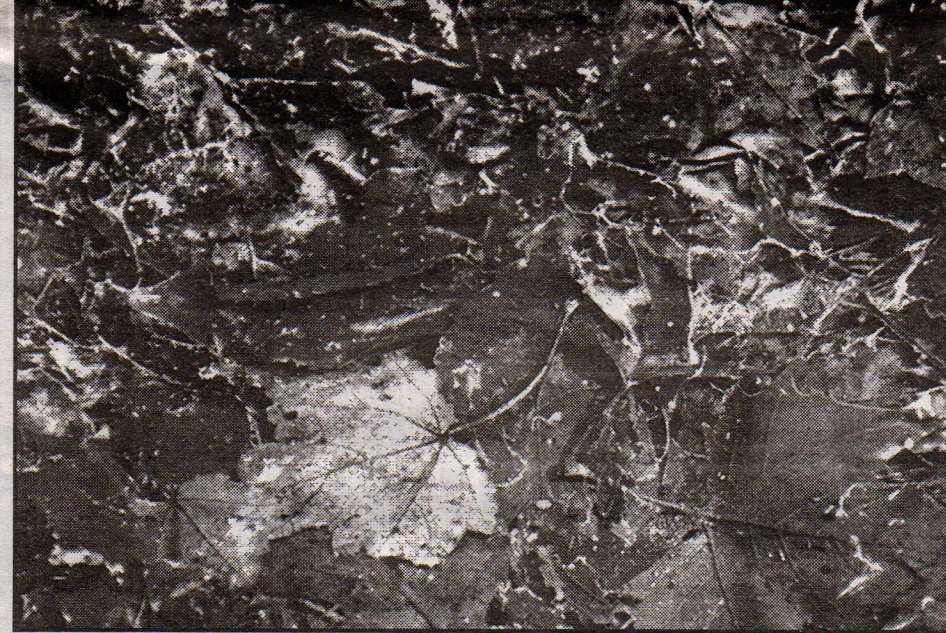
Spring (No. 2). Autumn Leaves in Marsh, by Xiomaro.