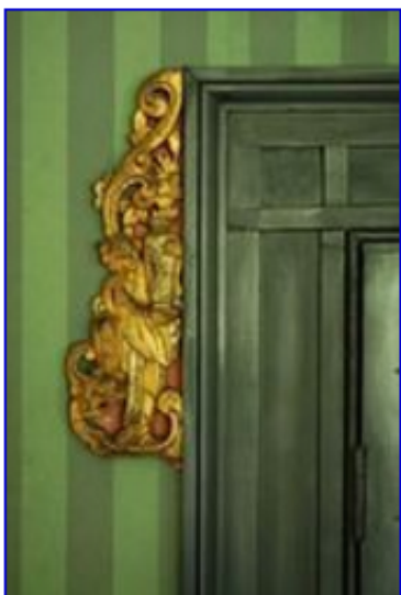
Weir Farm Closet After