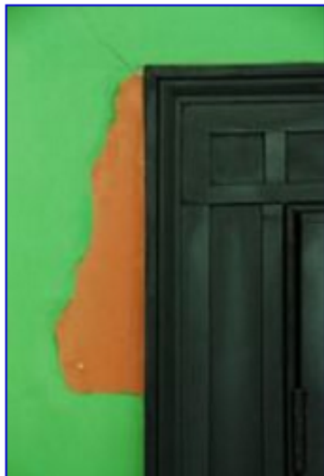
Weir Farm Closet Before