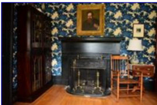
Weir Farm Bedroom After (contributed photo)

significant contrast between the rarely-seen empty interiors – stark, rustic and ethereal – and the rooms restored and furnished to their original colorful and wildly eccentric stylings.