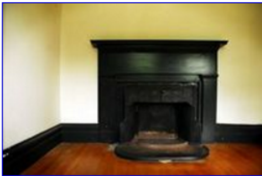
Weir Farm Bedroom Before (contributed photo)

Courant, News 12 and Fine Art Connoisseur. The National Park Service commissioned him in 2011 to artistically photograph the empty interiors of the key historic structures at Weir Farm, which were being restored for the first time in the history of the park. After the restoration was completed in 2014, he returned to photograph the stunning change.