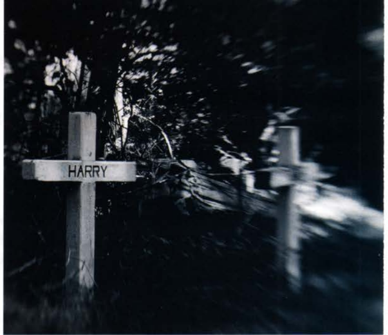
Pictured is a partial view of the slave burial ground at the William Floyd Estate.

Pretty much everyone is familiar with National Parks, such as the Grand Canyon and Yosemite. But the National Park System in our northeast region is rich in unique historical places that have their own kind of awe and beauty that can transform one's mind