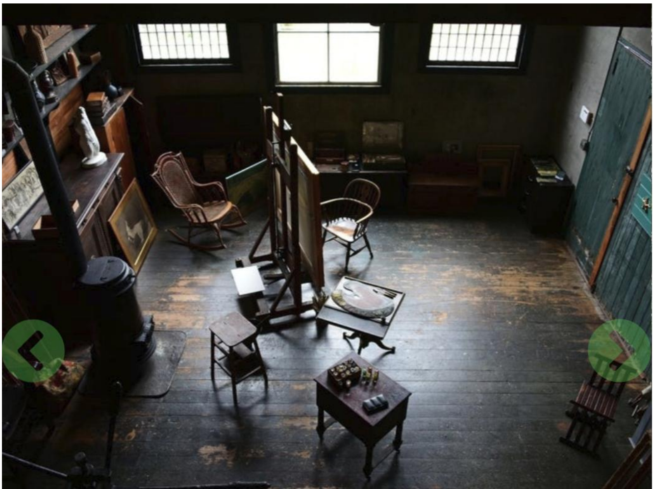
Rare view of Julian Alden Weir's studio

The Mark Twain Library was founded in 1908 by the most popular American author of the time, Samuel Clemens – best known as Mark Twain – who lived in Redding. The Mark Twain Library is located at 439 Redding Road, Redding, CT 06896 . The illustrated talk and book signing is on Saturday, July 27, at 3:00 pm, and is the final day of the Weir Farm photography exhibit. For more information and a free Weir Farm print, visit www.xiomaro.com