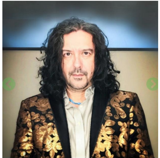
Xiomaro - Author and Artist (© 2019 Xiomaro.com)