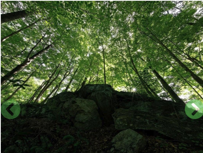
Landscape at Weir Farm