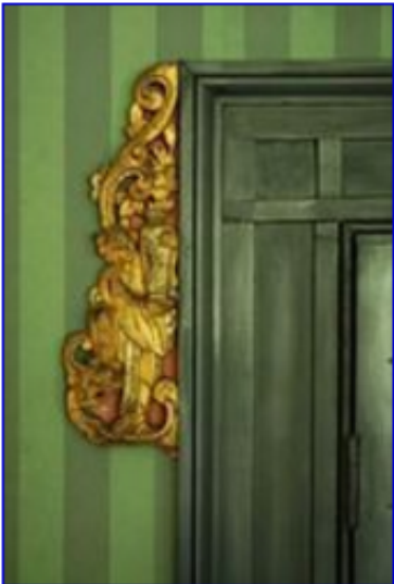
Weir Farm Closet After