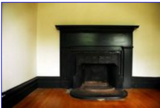
Weir Farm Bedroom Before (contributed photo)

Courant, News 12 and Fine Art Connoisseur. The National Park Service commissioned him in 2011 to artistically photograph the empty interiors of the key historic structures at Weir Farm, which were being restored for the first time in the history of the park. After the restoration was completed in 2014, he returned to photograph the stunning change.