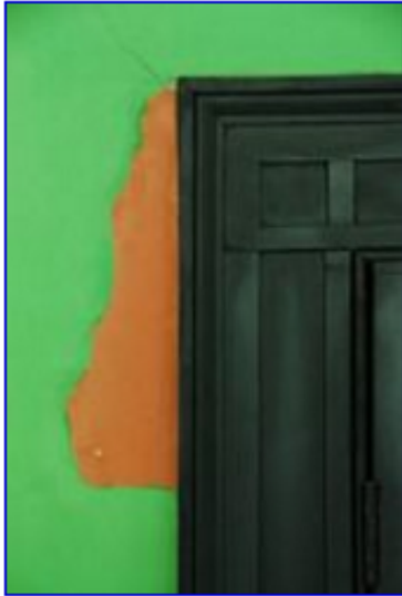
Weir Farm Closet Before