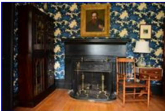
Weir Farm Bedroom After (contributed photo)

significant contrast between the rarely-seen empty interiors – stark, rustic and ethereal – and the rooms restored and furnished to their original colorful and wildly eccentric stylings.