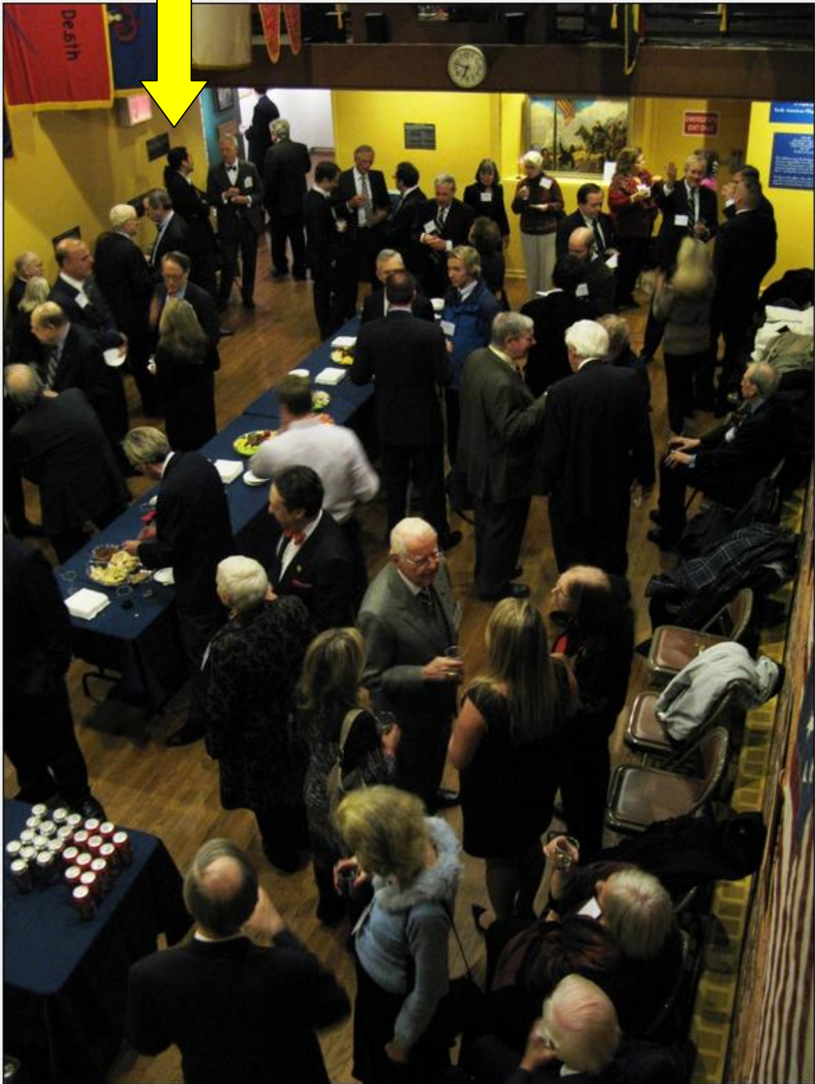
Cocktails in the Flag Gallery