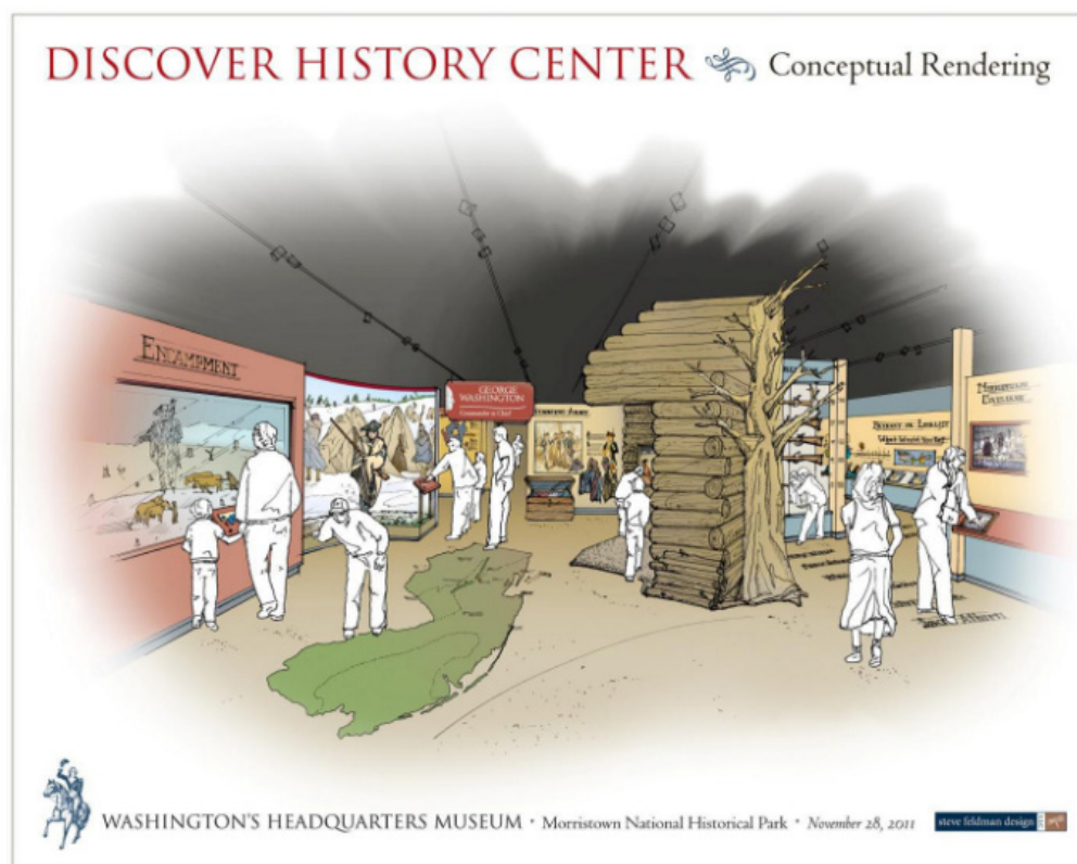
Rendering of Discover History Center, planned for Washington's Headquarters Museum in 2015.