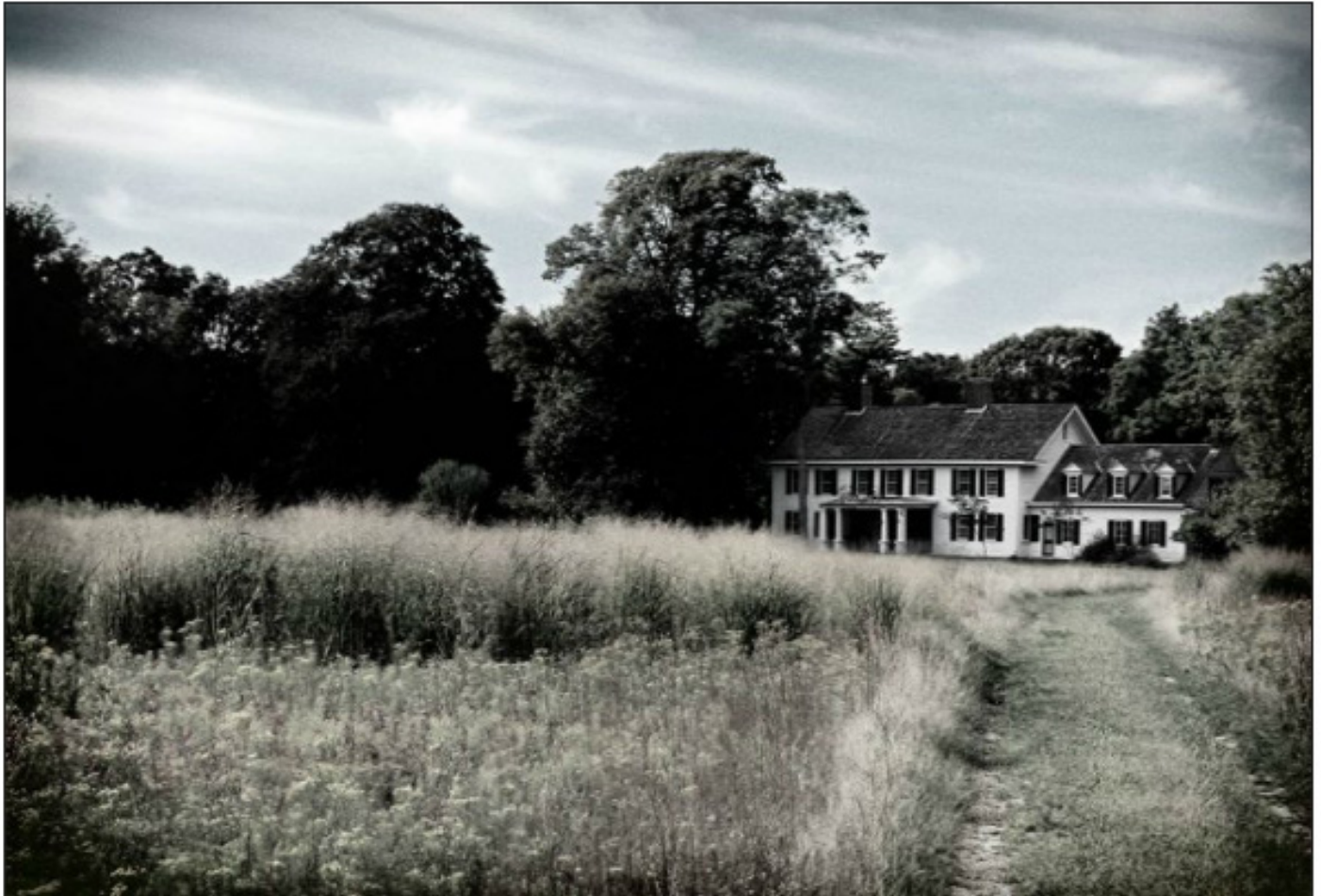
Old Mastic House at the William Floyd Estate.

The Other Side is on view January 11 to March 29, 2015 at the Oyster Bay Historical Society, 20 Summit Street, Oyster Bay, NY 11771, (516) 922-5032, oysterbayhistorical.org . A free opening reception will be held on January 11, 2015 from 3:00 pm to 6:00 pm. Free artist talks are scheduled for January 22, 2015 at 6:30 pm, March 15, 2015 at 2:00 pm and March 26, 2015 at 6:30 pm. A free limited edition photo e-book can be downloaded at www.xiomaro.com .