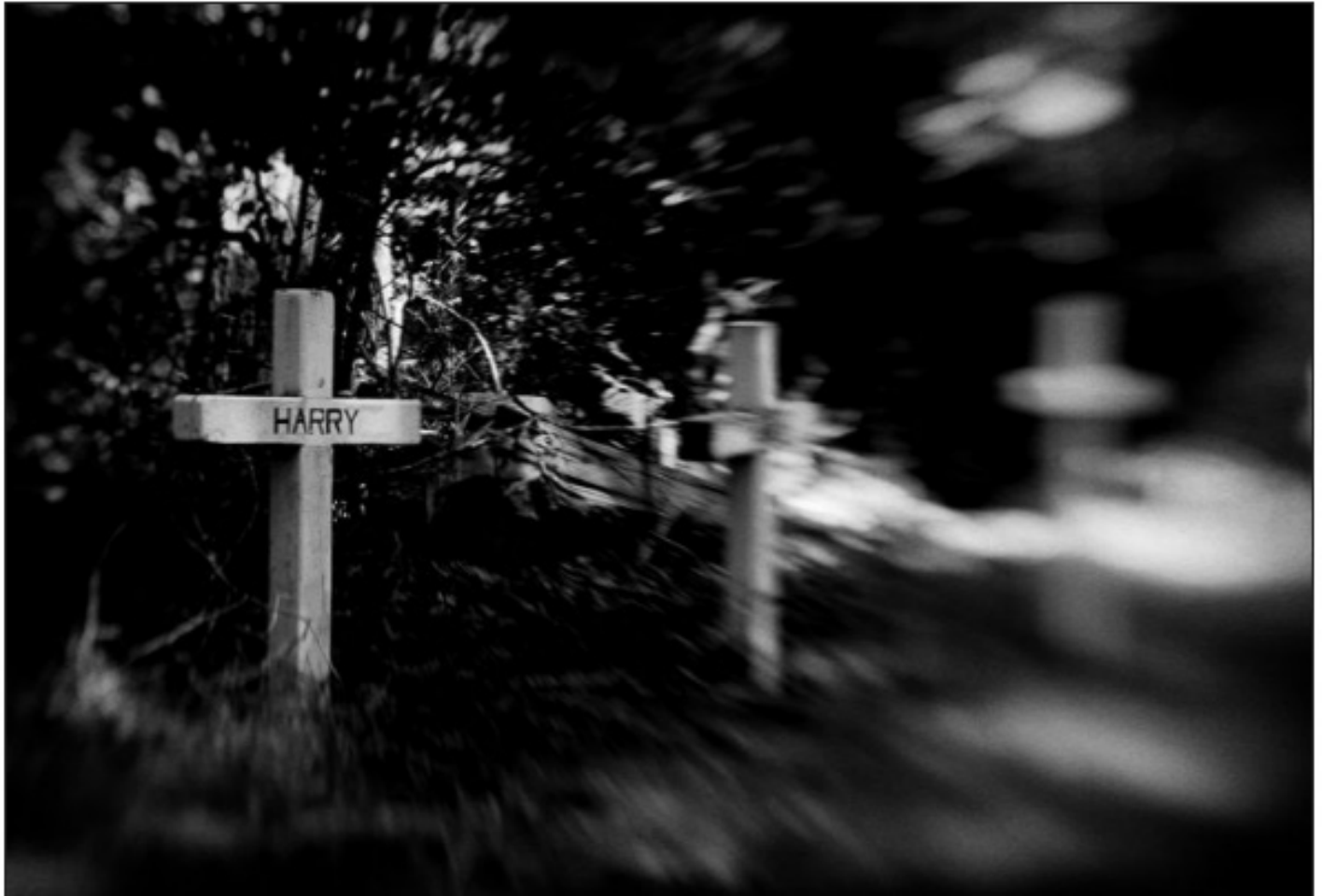
Crosses on William Floyd Estate.