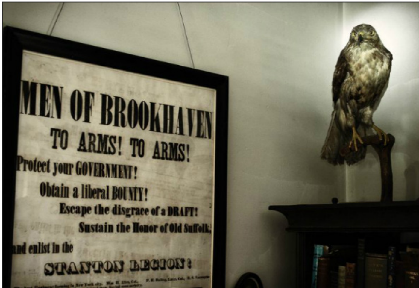
Civil War Recruitment Poster, Town of Brookhaven.

At the heart of the collection are photographs of undated wooden crosses bearing generic slave names, set apart on the other side of a fence from the elaborate individualized stones of the Floyd family cemetery. The photographs serve as spiritual memorials to the laborers—both enslaved persons and paid house servants of color—who worked on the estate. These plain wooden crosses, put in place sometime in the 1870s, represent in part the Floyd family's evolution from slave ownership to active military service in the Union army during the American Civil War.