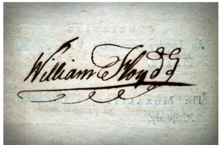
"America's Cradle" Begins With William Floyd