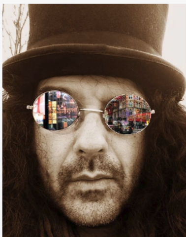
Xiomaro by Sapna Dhandh-Sharma

Photographs created by Long Island artist Xiomáro have been selected by the National Park Service for their Centennial Art Exhibit at the Patchogue Ferry Terminal gallery space, which welcomes visitors as they embark on their journey to Fire Island . The exhibit is open now through September 5, 2016 with a free reception open to the public on August 25 – the day the National Park Service celebrates its 100 year anniversary .