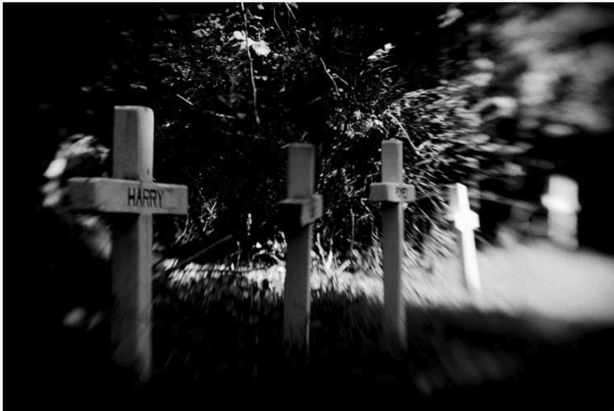
Slave Cemetery at the William Floyd Estate by Xiomaro

Included in the exhibition is Xio's photograph of the slave cemetery at the William Floyd Estate, which attracted much media attention during Black History Month last year. Another photograph, on view for the first time, is an image Xio created as part of a commission to artistically document Fire Island's High Dune Wilderness, the only federally-protected wilderness in New York State and one of the smallest managed by the National Park Service.