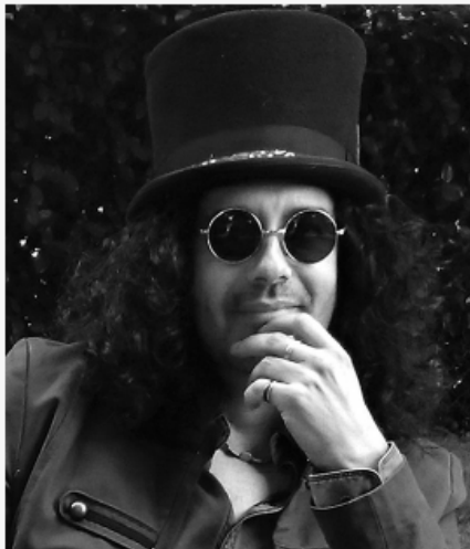
Xiomaro by Sapna Dhandh-Sharma

HARVARD, MASS. – Having turned 100 years old, the National Park Service inaugurates its second century with a fine art photographic exhibit at Harvard’s Fruitlands Museum titled “Find Your Park: National Parks in New England,” which includes several large-scale photographs by New York artist Xiomaro . The group display is open now through March 19, 2017.