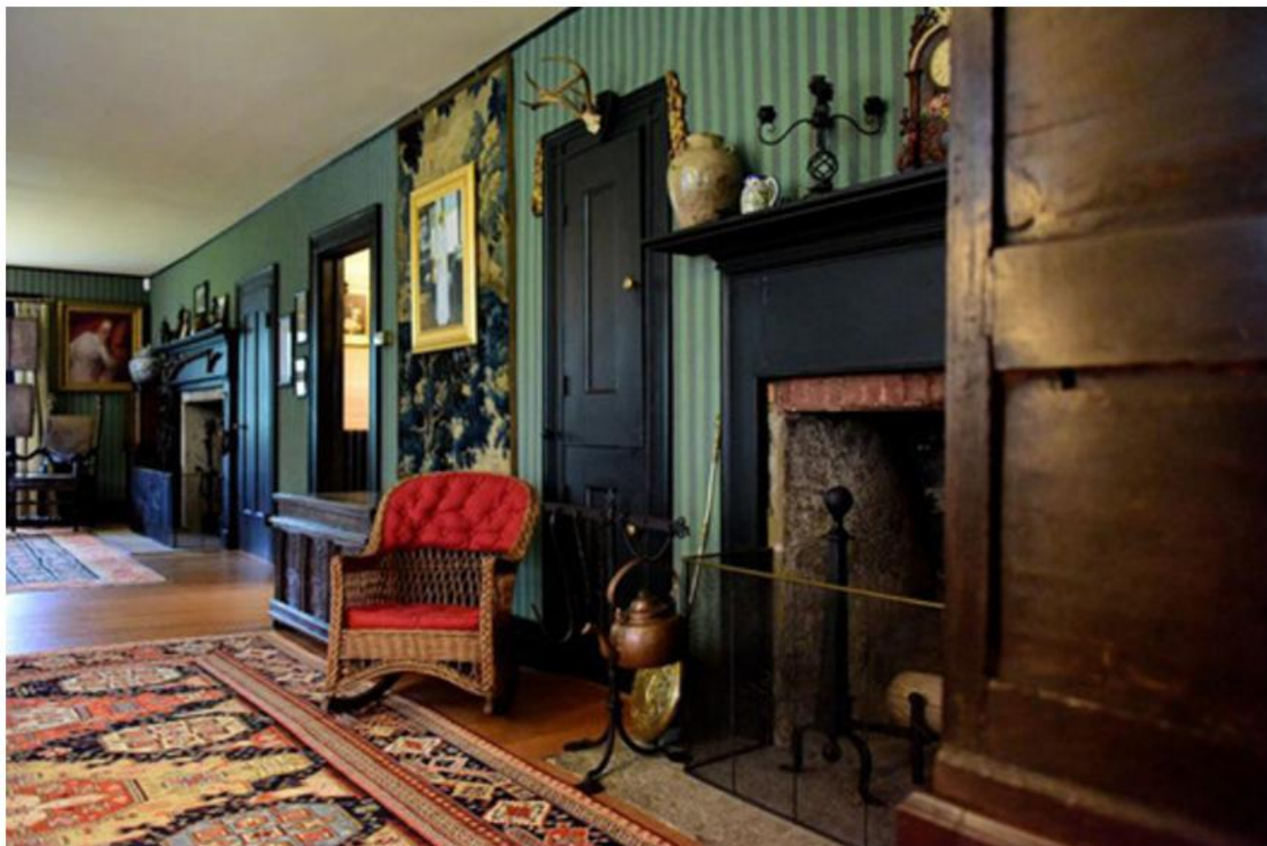
Weir Farm Living Room

photo used by permission Photo by Xiomaro.com