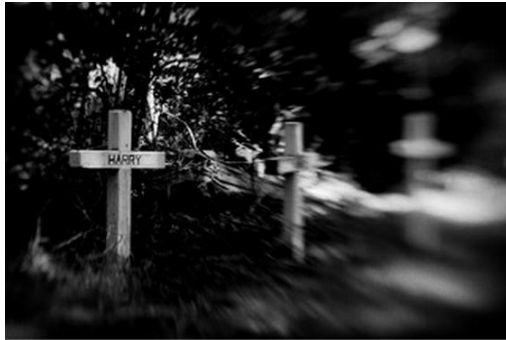
Xiomaro, The Courage to Reveal the Truth , 2014, Photography, 17" x 25"