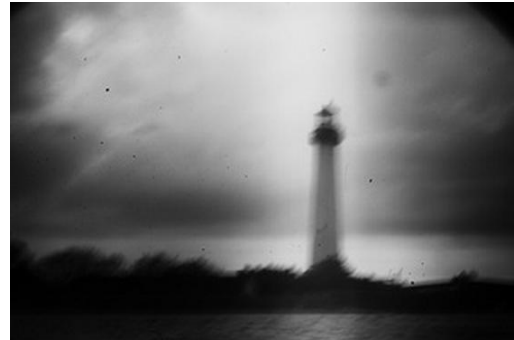
Xiomaro, The Courage to Break the Rules , 2014, Photography, 17" x 25" © Xiomaro.com