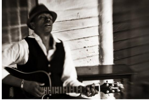
Xiomaro, The Courage To Free Your Soul , 2014, Photography, 17" x 25"