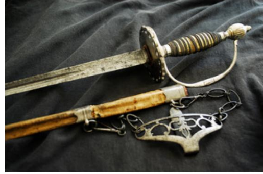
Xiomaro, William Floyd's Sword , 2014, Photography, 17" x 25" © Xiomaro.com