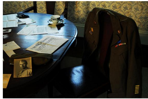
Xiomaro, World War II Jacket and Mementoes , 2014, Photography, 17" x 25"