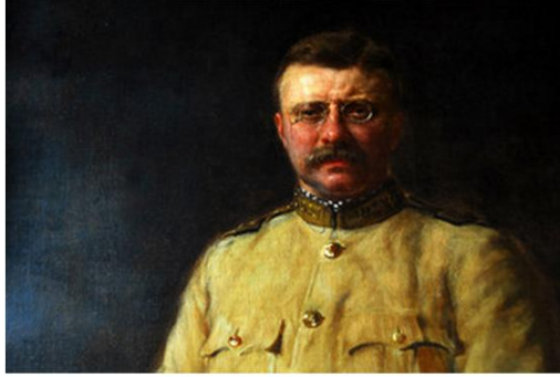
Xiomaro, Theodore Roosevelt, Rough Rider , 2014, Photography, 17" x 25" © Xiomaro.com