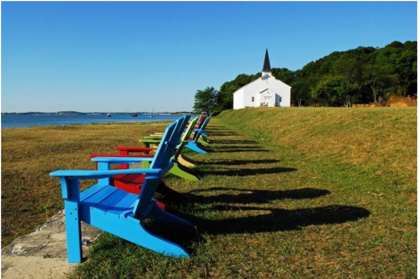
Xiomaro, Boston Harbor, Peddocks Island.