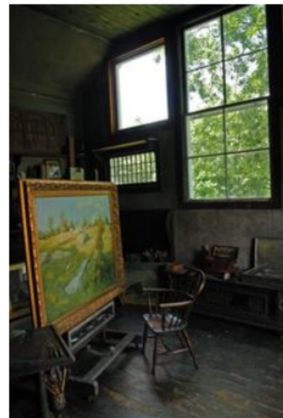
Xiomaro, Weir Studio, Wilton, Connecticut

Two images Xio created under a commission from Boston Harbor Islands National Recreational Area show the range of historical and scenic diversity that can be encountered. One photograph depicts a dramatically forlorn Civil War hospital on the prison grounds of Fort Warren on Georges Island – its most famous captive being the Confederate Vice President. Another is an inviting seaside view lined with colorful Adirondack chairs against the backdrop of a newly restored World War II army chapel on Peddocks Island.