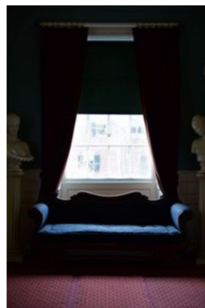
Xiomaro, Longfellow House, Entry Hall, Cambridge, Mass. courtesy Xiomaro