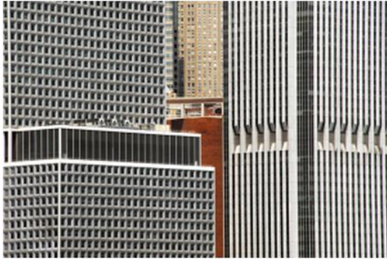
New York City - View from Governors Island