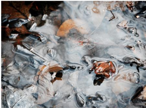
Peeper in Marsh - Weir Farm National Historic Site