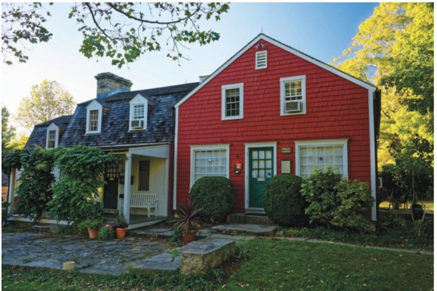
Weir Farm, Burlington House

Reprinted from Weir Farm National Historic Site by Xiomáro (Arcadia Publishing, 2019)